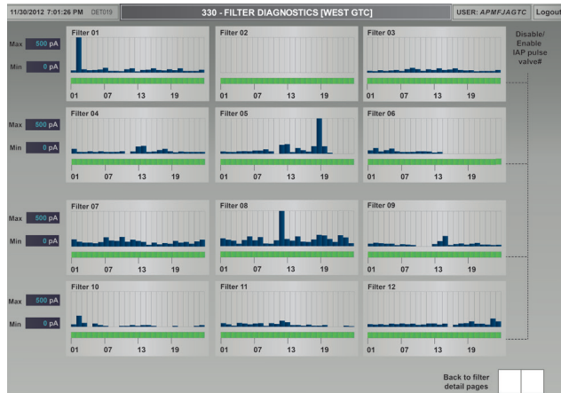
Control Room view of DynaCHARGE leak detection by row.

"Auburn FilterSense is our main filter analyzer; it would not be possible to detect small leaks without it." – Process Engineer