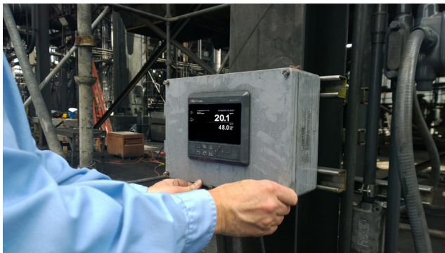
Auburn FilterSense engineer commissioning DynaCHARGE™ PM 100 PRO.

Unlike Auburn FilterSense, other sensors required monthly to quarterly cleaning, sometimes weekly!