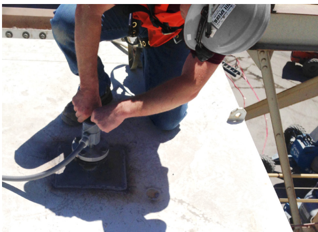
Auburn FilterSense engineer commissioning particulate sensor.

"Intelligent online pulse cleaning is providing 0.1 InWC DP control."