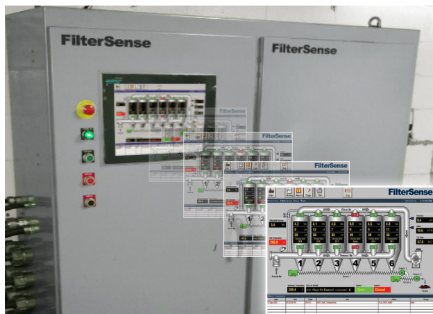
Engineered B-PAC System monitors and controls a network of multi-compartment Coke, Desulf and Casting Baghouses at a steel mill (shown left). Screenshot (lower right): shows particulate levels and damper control.

With the ability to locate leaks by filter row, monitor solenoid and pulse valve health, minimize pulsing, and maintain baghouse DP within 0.1 InWC, operators at steel mills minimize downtime and maintenance costs, while reducing and often eliminating exposure of plant personnel to hazardous particulate and confined spaces.