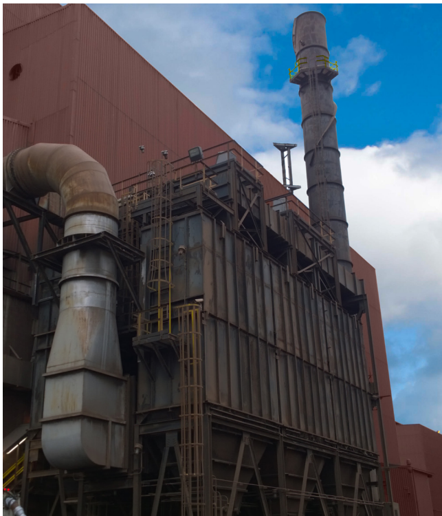
“Desulf” baghouse at a US steel mill. Leak analysis, pulse cleaning, DP, solenoids, valves, airflow, and temperature are monitored by an engineered B-PAC™ System (shown right).

“B-PAC™ guarantees proper airflow, increasing the efficiency of the upstream coke oven.”