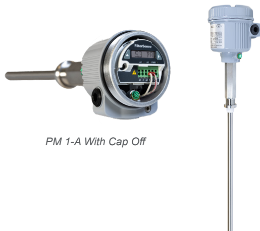
PM 1-A With Cap Off

3-5x More Functionality when compared to comparable devices.