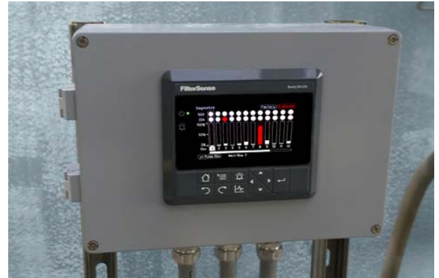
B-PAC™ ultra-rugged (field-mountable) user interface displays diagnostics (data also available over Fieldbus).

Another B-PAC™ installation demonstrated the added benefit of IntelliPULSE™ control, which maintains baghouse DP within ±0.1 InWC by automatically adjusting and minimizing pulse cleaning. This maintains ideal air flow through the upstream spray dryer, increasing its performance. Intelligent pulsing significantly reduces compressed air consumption and stress on the filter media, extending filter life and reducing replacement costs. This baghouse’s pulse rate was reduced 90% and yielded an annual compressed air savings over $12,000 (see Table 1).